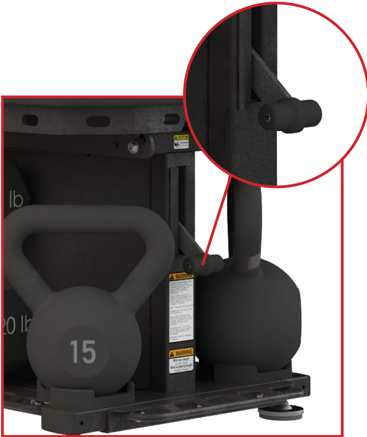
When engaged, the lever drops down a center caster wheel that allows easy movement of the bench.