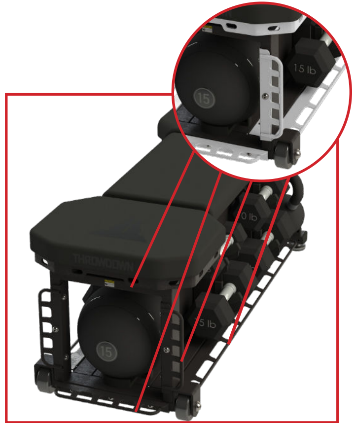
Resistance rails create a variety of training options by providing a multitude of anchor points along bench edges.