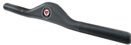
TOUCH HEART RATE HANDLE

FDF is the leader in designing and manufacturing a range of adjustable Fluid Resistance fitness machines for commercial and residential applications. At the heart of the fitness range is our unique and patented Twin Tank Fluid Resistance system. The adjustable Fluid Resistance system challenged the conventional thinking of how water could work to provide adjustable resistance rather than just a liquid mass flywheel. The patented Twin Tank system provides silky smooth resistance at any speed and is perfect for cardio training, warm-ups, cool downs, intense HIIT workouts or rehabilitation programs. FDF categorizes the range of adjustable Fluid Resistance machines under the banners, FluidRower , FluidExercise and FluidPowerZone , see the adjacent web links. FDF products are distributed throughout the globe and are popular in Fitness Centers, Hotels and Apartments, Sporting Clubs, Universities, First Responders, Defence Force Training Facilities and Physical Rehabilitation Clinics.