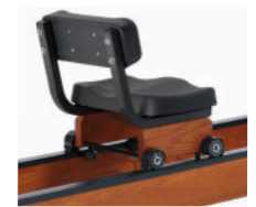
SEAT BACK KIT